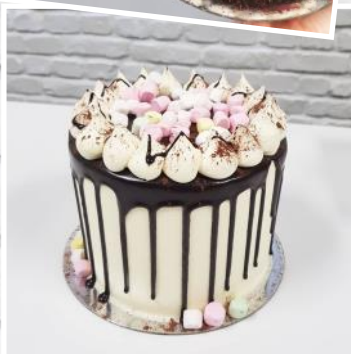
Hot Chocolate Drip (Sml.)