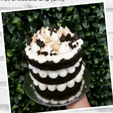
Naked Pic's Peanut Buttercup (Sml.)