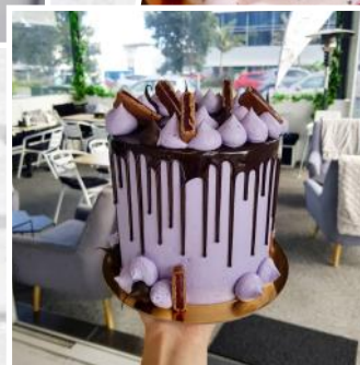
Turkish Delight Drip Cake (Sml.)