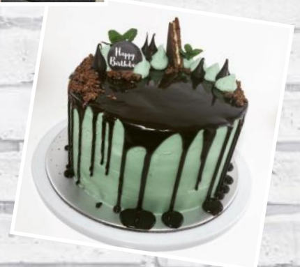
After 6 Mint (Med.) plus Happy Birthday Disc