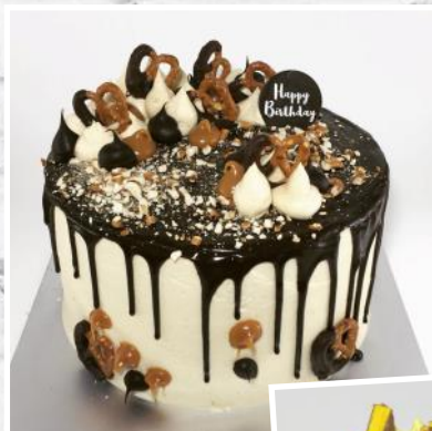
Vanas Pic (Med.) plus Happy Birthday Disc