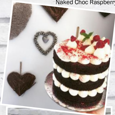
Naked Choc Raspberry (Sml.)