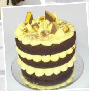
Naked Perky Nana (Sml.)